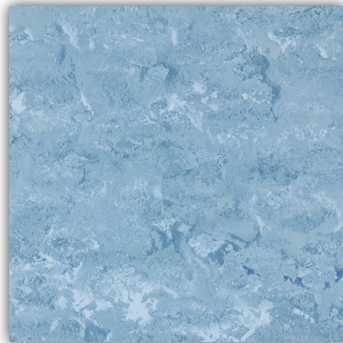
520 Blue Waves