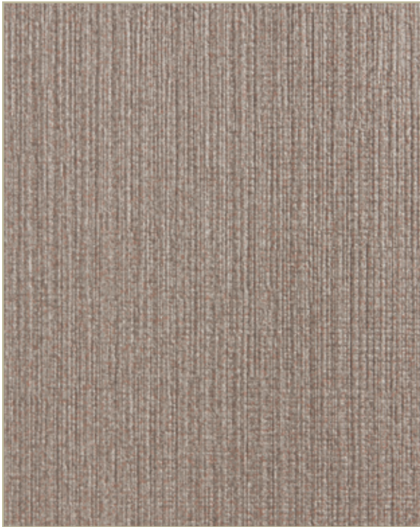
833 Autumn Fog