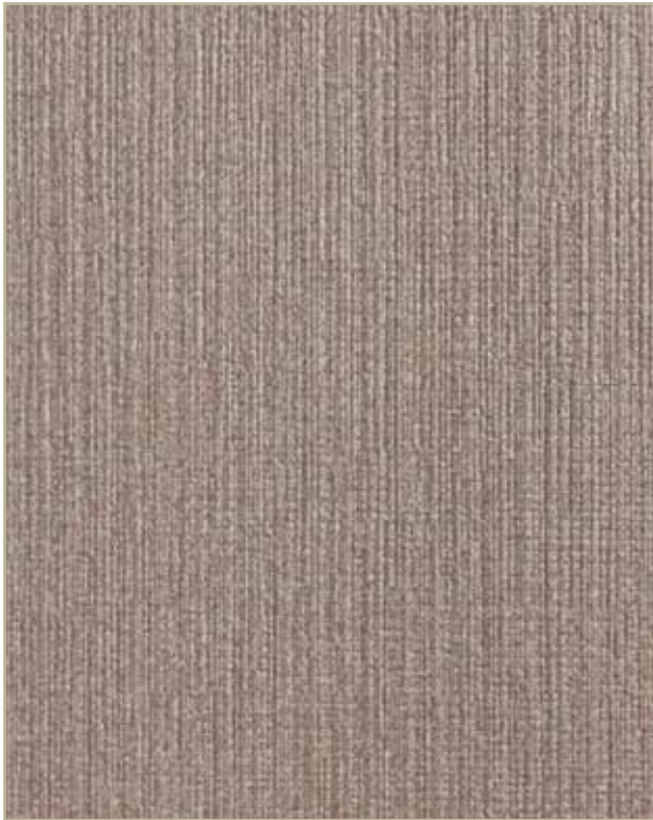
833 Autumn Fog