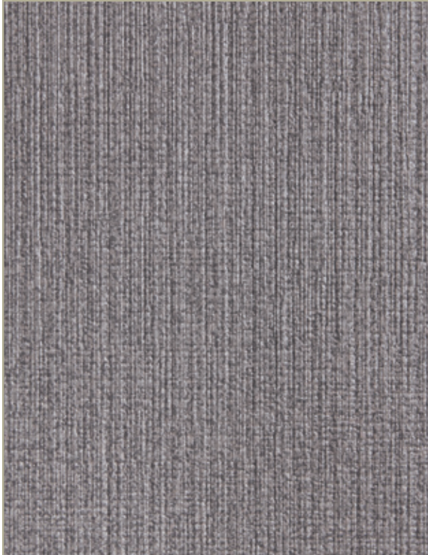
936 Chromed Cloud