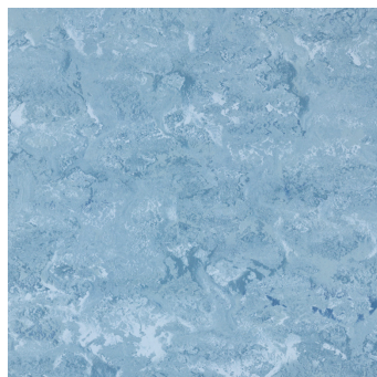
520 Blue Waves